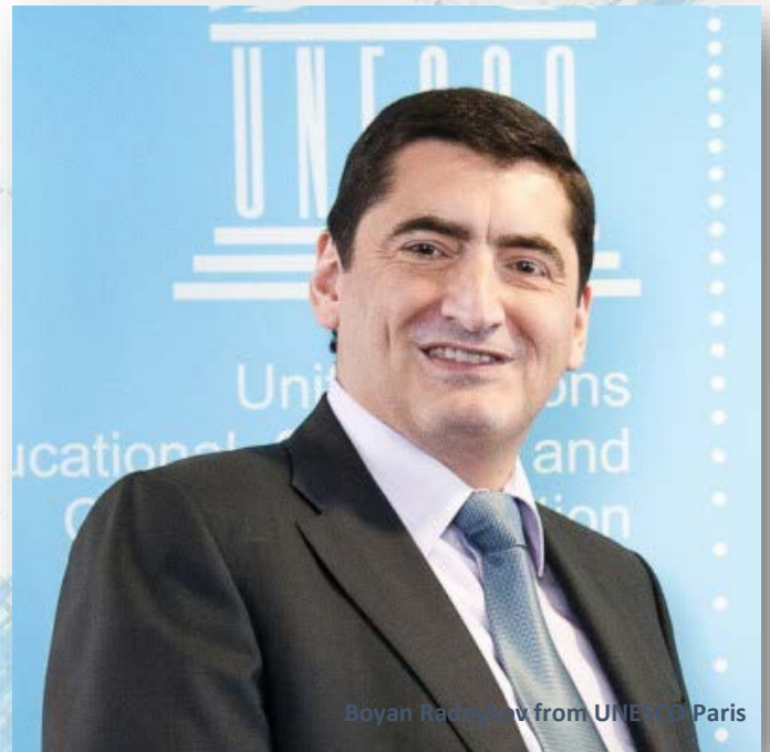
Boyan Radoykov from UNESCO Paris

For the full article, please visit the following link.